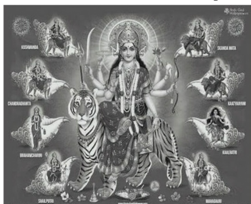
Figure 1.1 Goddess nav durga

Mann is a Hindi word is common in use in INDIA and Hindu culture. English translation of Mann is Mind or brain which is wrong. Its Hindi to Hindi translation is heart which is also wrong but in Hindu culture and scriptures Mann is defined as invisible mind which is composition of heart and brain and a core part of human personality which directs our behavior towards fulfilling desires. This means in Hindu culture the knowledge of Mann and its function was exist in ancient period and concerned book must be there thousand years ago but is not available now. Here is picture of Hindu God