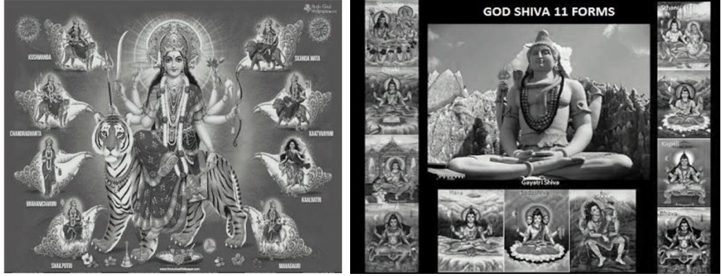
Figure 1.1 Goddess nav durga

Mann is a Hindi word is common in use in INDIA and Hindu culture. English translation of Mann is Mind or brain which is wrong. Its Hindi to Hindi translation is heart which is also wrong but in Hindu culture and scriptures Mann is defined as invisible mind which is composition of heart and brain and a core part of human personality which directs our behavior towards fulfilling desires. This means in Hindu culture the knowledge of Mann and its function was exist in ancient period and concerned book must be there thousand years ago but is not available now. Here is picture of Hindu God